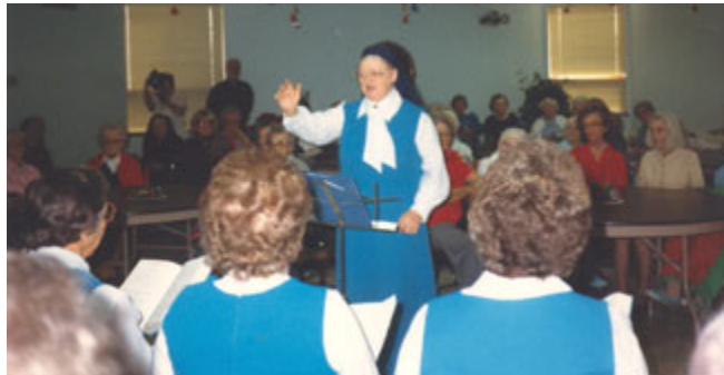
The Jubileers perform for their dynamic director. (circa 1980's)

After 55 years of religious profession, when asked if she would be willing to live this life again, she answers: "Yes, without a doubt!" for Jesus continues to be her life's meaning and goal!