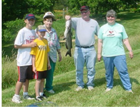
Fishing With Friends